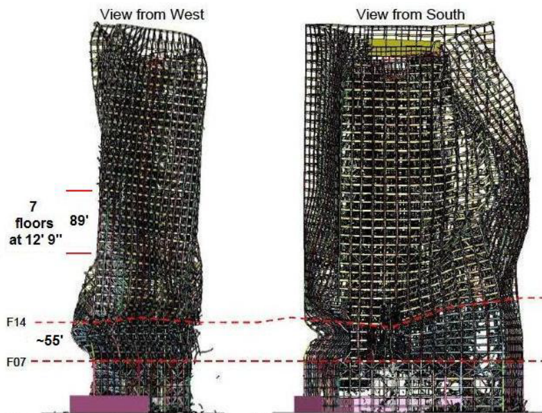
Figure 12-62. Exterior column buckling after initiation of global collapse with debris impact and fire-induced damage (slabs removed from view).

The NIST model (below) shows the exterior framework still bending after about 34 feet of descent, well into the free-fall portion of the collapse. In free fall, all the energy is being converted into motion, but bending steel requires energy, so the NIST model is not falling at free fall.