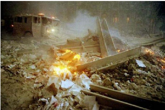
Figure 3: Molten metal witnessed by dozens completely omitted by NIST report.

More than two-dozen eyewitnesses have reported seeing molten steel in the basements of all three WTC high-rises. This is confirmed by photos and verified by infrared satellite images indicating extremely high temperatures. Yet John Gross, Lead Engineer for NIST, denies even having heard any reports of molten metal at Ground Zero. 5