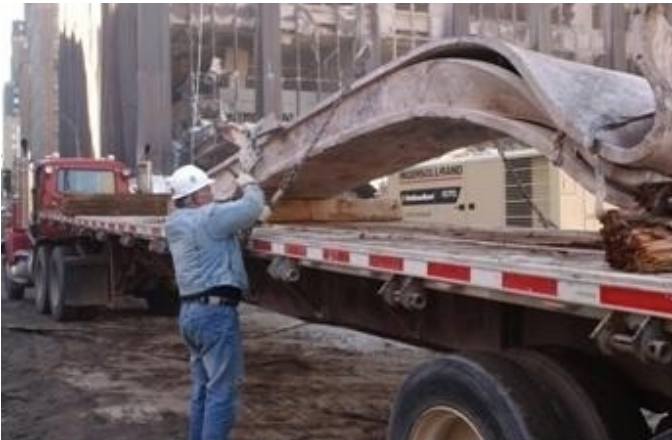
Figure 2: 400 truck-loads of steel per day were removed.

As the NIST report admitted, the three WTC skyscrapers whose destruction was blamed primarily on fire were the only cases of modern steel-framed high-rise buildings in world history to have ever completely collapsed because of fire. The structural steel was therefore extremely important evidence. Yet this evidence was quickly hauled away by up to 400 trucks per day and taken ... where? Not to a secure place to await inspection, but to barges where it was readied for shipping.