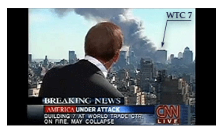
Figure 2: Aaron Brown of CNN reports WTC 7's collapse more than an hour prior to it occurring.

In another news clip,<sup>7</sup> while Building 7 is seen standing fully erect and showing no signs of impending trauma, CNN's Aaron Brown gives the following report: "We are getting information now that one of the other buildings, Building 7, in the World Trade Center complex, is on fire and has either collapsed or is collapsing..."