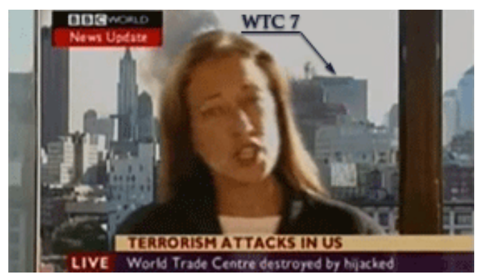
Figure 1: Jane Standley of BBC reports WTC 7's collapse more than 20 minutes prior to it occurring.

In another news clip,<sup>7</sup> while Building 7 is seen standing fully erect and showing no signs of impending trauma, CNN's Aaron Brown gives the following report: "We are getting information now that one of the other buildings, Building 7, in the World Trade Center complex, is on fire and has either collapsed or is collapsing..."