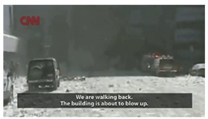
Figure 3: How did construction workers and police on the scene of WTC 7 that afternoon know that "The building is about to blow up?"

More evidence of foreknowledge of the collapse of Building 7 is preserved in this video where an eyewitnesses can be heard saying: "Keep your eye on that building. It'll be coming down soon." And "The building is about to blow up. Move it back." And also, "We are walking back. The building is about to blow up."8